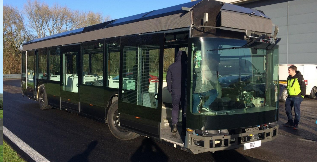
A place for testing, filming, research & development