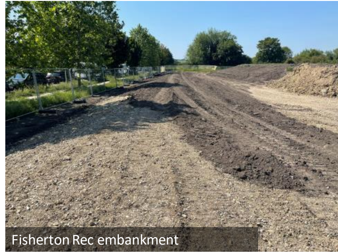
Fisherton Rec embankment