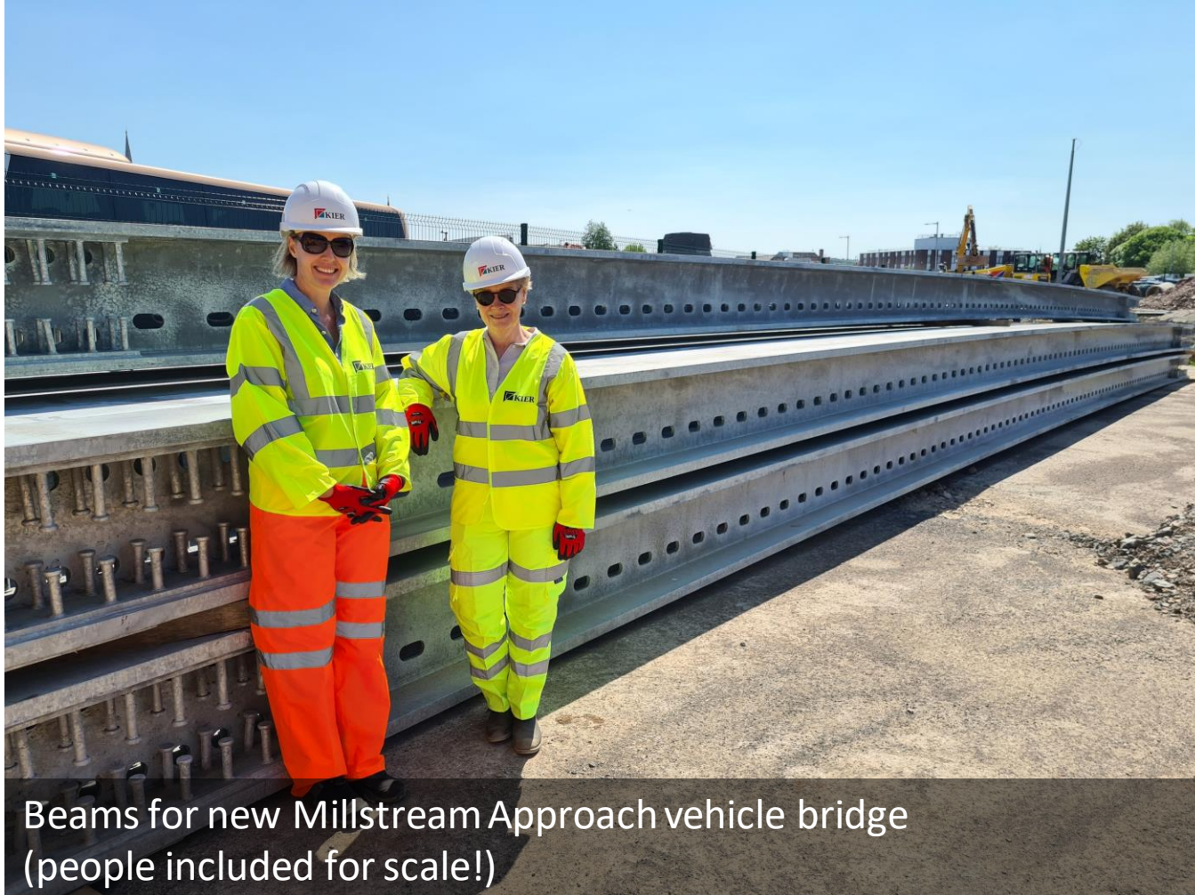
Beams for new Millstream Approach vehicle bridge (people included for scale!)